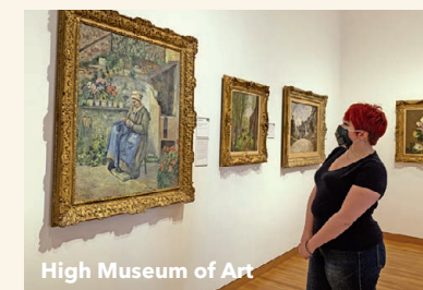
High Museum of Art

1315 Peachtree St. NE Atlanta, GA 30309 404.979.6455 www.museumofdesign.org The only museum in the southeast devoted exclusively to the study and celebration of all things design. MODA creates engaging exhibits of architecture, industrial and product design, interiors and furniture, graphics, fashion and more.