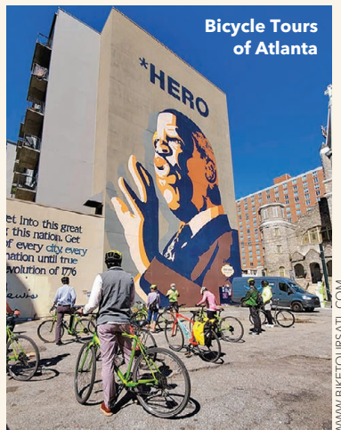
Bicycle Tours of Atlanta WWW.BIKETOURLS.ATL.COM

Civil Rights Tours 320 Martin Luther King, Jr. Dr., Loft #13 Atlanta, GA 30312 404.386.0992 www.civilrightstour.com