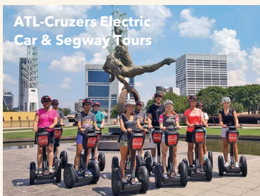
ATL-Cruzers Electric Car & Segway Tours WWW.ATLCRUZERS.COM

Bicycle Tours of Atlanta 659 Auburn Ave. Studioplex Lofts in the Old Fourth Ward Atlanta, GA 30312 404.273.2558 www.biketoursatl.com