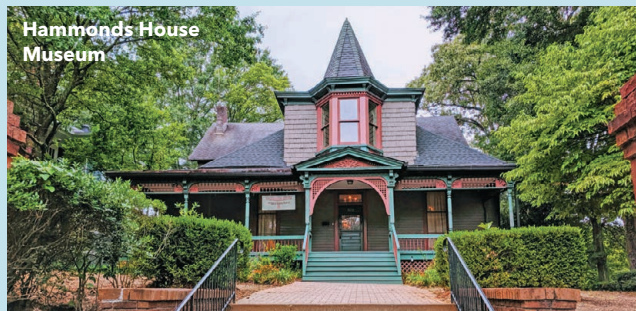
Hammonds House Museum