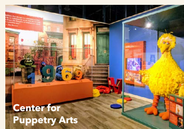
Center for Puppetry Arts

395 17th St. NW Atlanta, GA 30363 404.881.0900 www.thegatemuseum.org The Millennium Gate Museum is a triumphal arch and Georgia history museum located in Atlanta, on 17th Street in the Atlantic Station district of Midtown. Based on the Arch of Titus, the monument celebrates peaceful accomplishment.