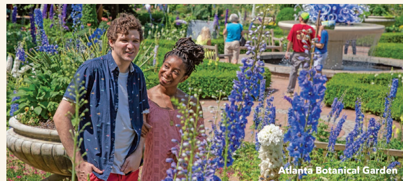
Atlanta Botanical Garden

1404 Spring St. NW Atlanta, GA 30309 404.873.3391 www.puppet.org Millions of visitors have been introduced to the wonder and art of puppetry for over 4 decades and is the United States' largest organization dedicated to this art form. The center focuses on three areas: performance, education and museum. It is one of the few puppet museums in the world.