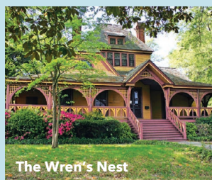
The Wren's Nest

1050 Ralph David Abernathy Blvd. NW Atlanta, GA 30310 404.753.7735 www.wrensnest.org The Wren's Nest, the historic home of Joel Chandler Harris, and the birthplace of the American illustrated storybook