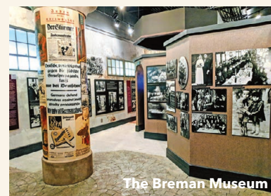
The Breman Museum

1440 Spring Street NW Atlanta, GA 30309 678.222.3700 www.thebreman.org The William Breman Jewish Heritage Museum is a cultural center in Atlanta dedicated to Jewish history, culture and arts with special emphasis on Georgia and the Holocaust.